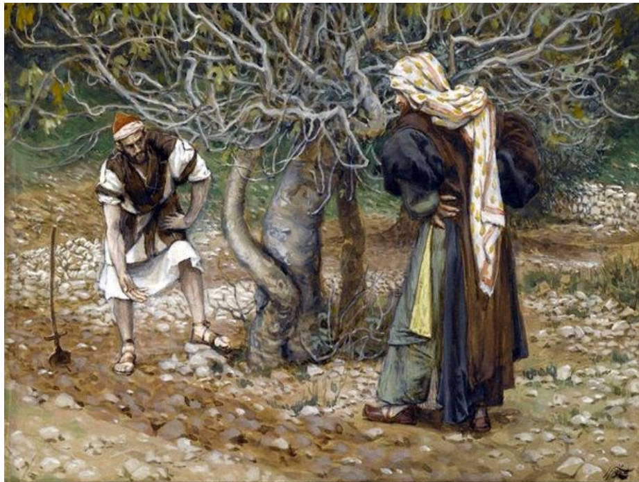
The Vine Dresser and the Fig Tree by James Tissot