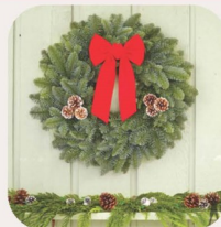
22" Noble Fir Wreath $50.00 - PICKUP

Order online or by phone October 1 - November 1