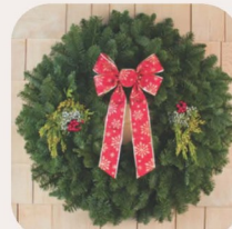
22" Mixed Evergreen Wreath $60.00 - DELIVERY