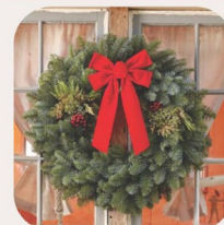
28" Mixed Evergreen Wreath $55.00 - PICKUP