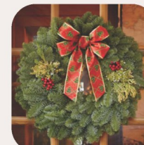
28" Mixed Evergreen Wreath $70.00 - DELIVERY