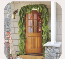
10' Western Cedar Garland $50.00 - PICKUP