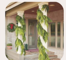
10' Western Cedar Garland $70.00 - DELIVERY

ORDERS ARE DUE BY 11/1 WITH PICKUP IN EARLY DECEMBER / DIRECT DELIVERY ARRIVES DURING THE TWO WEEKS AFTER THANKSGIVING