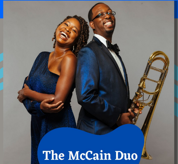
The McCain Duo