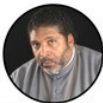
Rev. Dr. William J. Barber II, Co-Chair, PPC:NCMR

National Civil Rights Museum (450 Mulberry St)