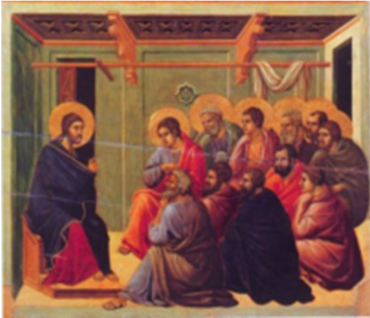
Jesus prays to the Father that his followers "may all be one as we are one" and that "the love with which you love me may be in them, and I in them"

If you have not made a pledge to the ACA, we hope that you will prayerfully consider doing so as your means allow. We would love to see the number of families participating increase.