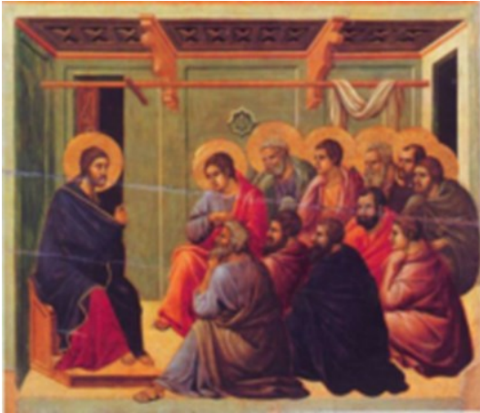
Jesus prays to the Father that his followers "may all be one as we are one" and that "the love with which you love me may be in them, and I in them"

If you have not made a pledge to the ACA, we hope that you will prayerfully consider doing so as your means allow. We would love to see the number of families participating increase.