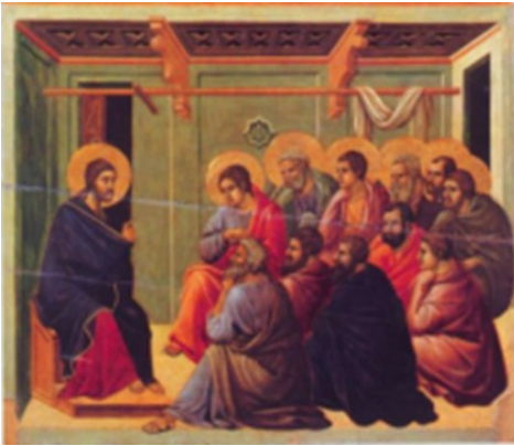
Jesus prays to the Father that his followers "may all be one as we are one" and that "the love with which you love me may be in them, and I in them"

If you have not made a pledge to the ACA, we hope that you will prayerfully consider doing so as your means allow. So far, 18% of our families have contributed. We would love to see the number of families participating increase.