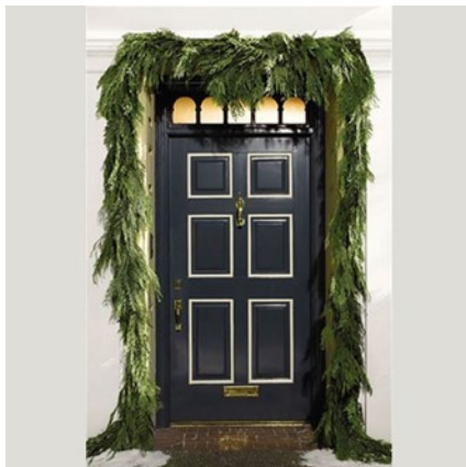
10' Western Cedar Garland