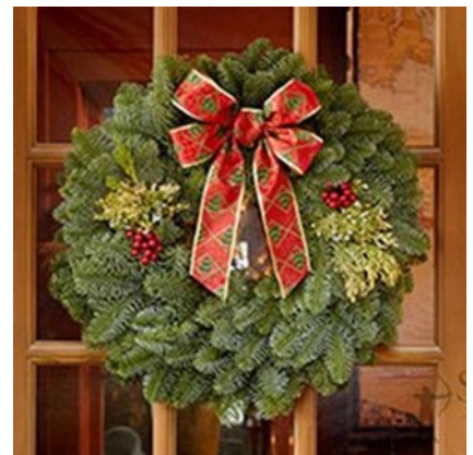
28" Mixed Evergreen Wreath

After all Masses October 14 , the Dorothy Day House will be taking pre-orders for Christmas wreaths and garlands as a fundraiser for their ministry to homeless families.