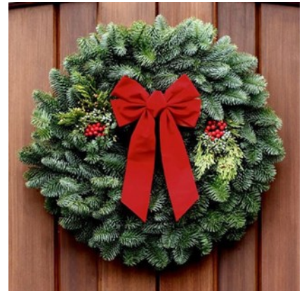
22" Mixed Evergreen Wreath