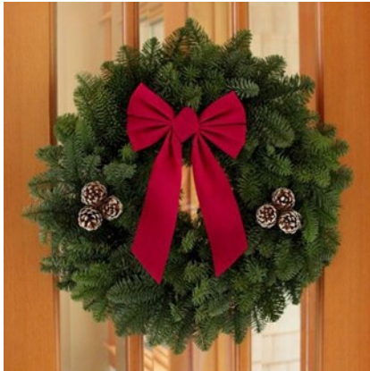
22" Noble Fir Wreath