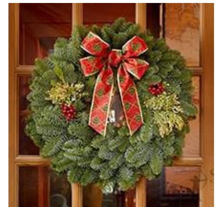
22" Mixed Evergreen Wreath

The Dorothy Day House (DDH) provides temporary housing and support services for homeless families in Memphis, Tennessee. Working with other local agencies, staff members and volunteers provide families in need with a safe environment and the means to re-establish their independence.