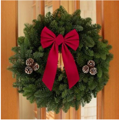
22" Noble Fir Wreath

After Sunday Masses next week , the Dorothy Day House will be taking pre-orders for Christmas wreaths and garlands as a fundraiser for their ministry to homeless families.