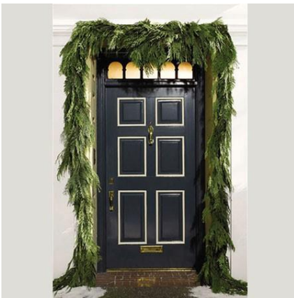
10' Western Cedar Garland