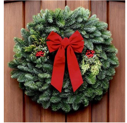
28" Mixed Evergreen Wreath

Representatives of the DDH will be taking orders after all Masses on October 22 nd . Orders can also be placed online at www.dorothydaymemphis.org between now and November 2 nd . For more information, call 901-726-6760.