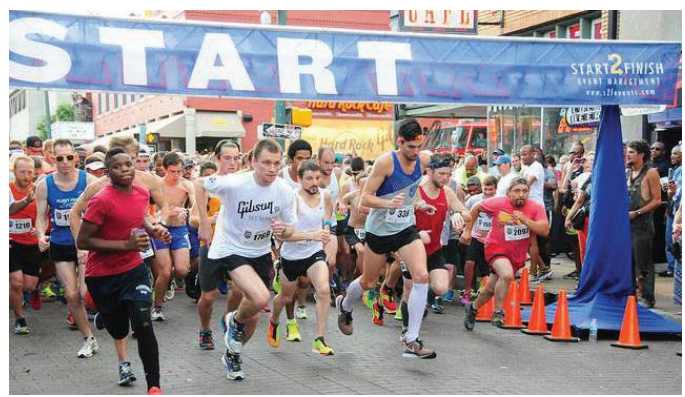
Please pray for the safety of all of our participants and spectators.